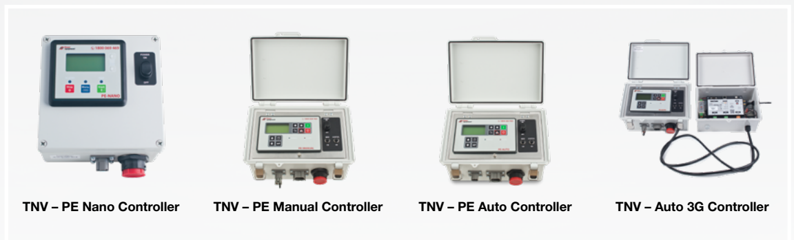
TNV - PE Nano Controller

A choice of control panels is available. The PE Manual and PE AUTO control panels have a sturdy enclosed case with weather seal to protect against dust and water, while the PE NANO control panel has an open style enclosure and is rated at IP65 for longer protection.