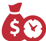
Reduce construction time – earn more.