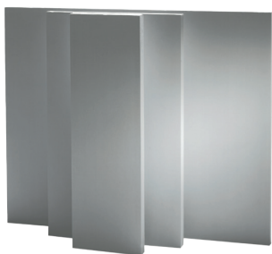
SKAMOTEC 225 building boards can easily be cut into any shape and size.